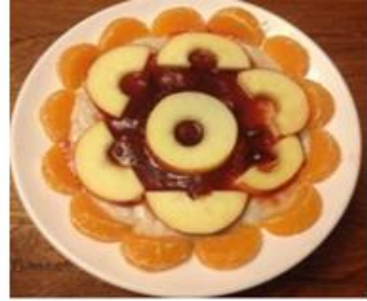
adaywithoutporridge Fruit flower! #porridge #nortonsdairy #citrusforwinter daverogers110 Go Chris we want to see your creations on https://showusyourroats.quaker.co.uk