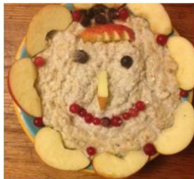
adaywithoutporridge Tax return sent!! Happiness 😊 #porridge #persistence #diggingin #nortonsdairy #appleaday

Norman: It sounds as if there is a real commitment that every day you’ll have to do something, it’s not an option not to have a design on your bowl of porridge at the end of the making process.