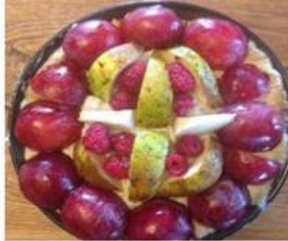
adaywithoutporridge Plums pears and porridge! #pears #plums #porridgepower #autumn