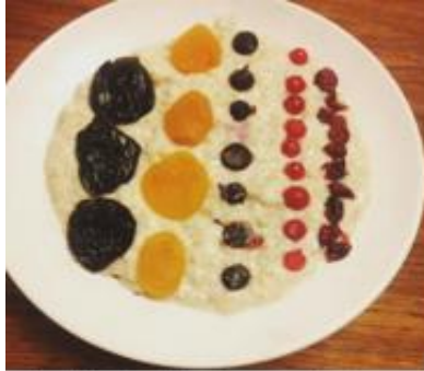
adaywithoutporridge The accountant's meeting! Food for the day! #beansinarow #lookingtothefuture #blueskythinking #nortonsdairy #porridge #moorescarrott