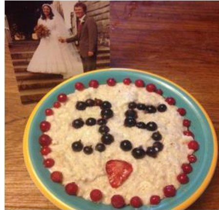
adaywithoutporridge Wedding Anniversary #35years #shedrivesmecrazy #couldntbehappier #couldntbewithouter # moreadventuresbeckon #showusyouroats